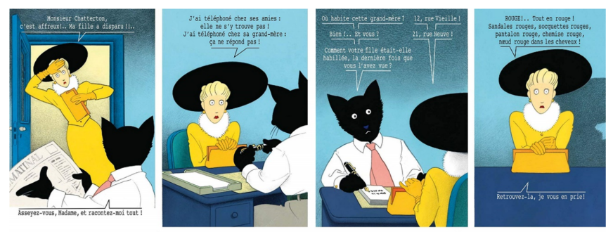
Note: © 1994 Y. Pommaux © 1994, École des Loisirs, Paris.