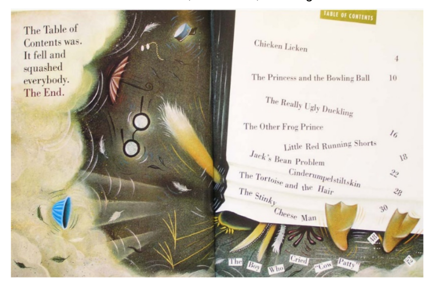
Note: © 1992 Jon Scieszka (texts), © 1992 Penguin Putnam Inc. (illustrations), © 1992 Viking Books for Young Readers.

Picture of the Table of contents, which falls, crushing the characters.