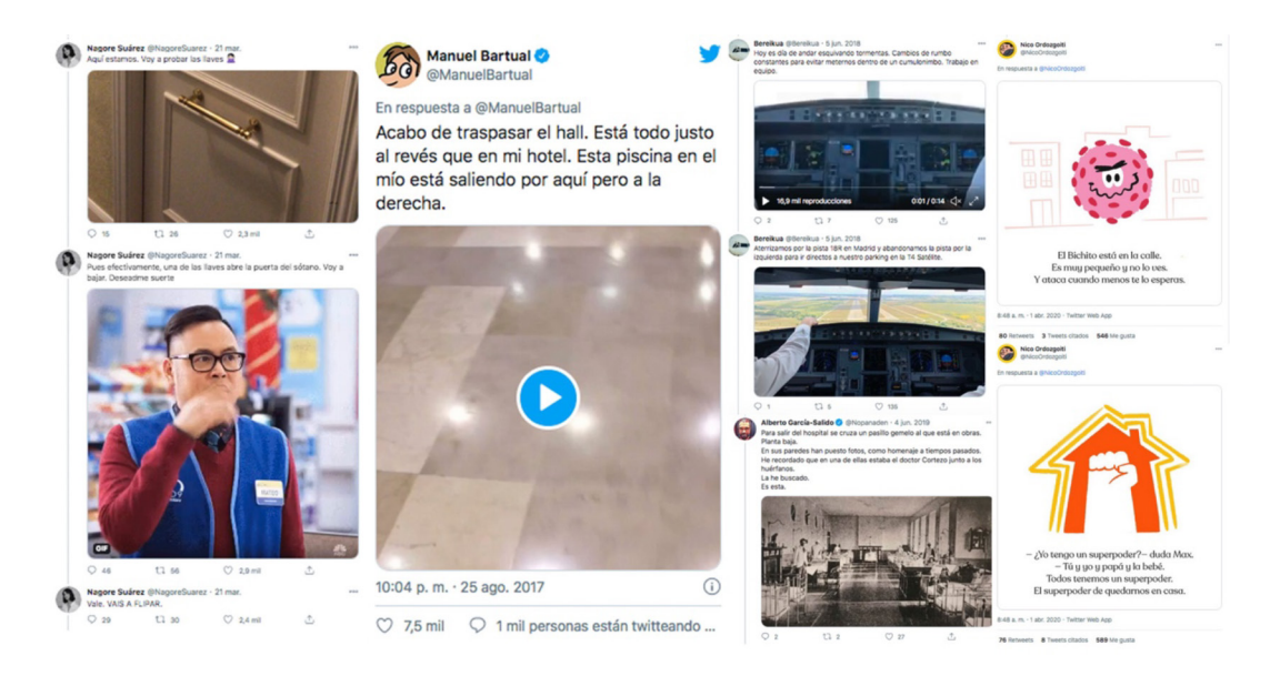
Image 1. Examples of successful audiovisual resources applied to Twitter threads.

@NagoreSuarez, or because they are part of the fiction, as in Red Monkey .