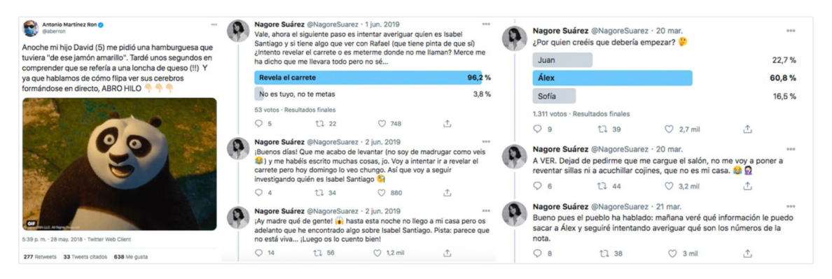
Image 3. Stylistic resources used in Twitter threads.

they receive, with positive comments expressing affection or congratulations, as well as the increase in the number of followers. Analysis of the comments indicates that most of them are positive comments, and the readers are very participative, although there are always critical users, above all those who compare the new threads with previous ones that obtained a lot of relevance. In many cases, the same comments show the suspension of disbelief by users who, although reading stories that may seem fictional, are committed to the narrative to the point of even feeling somewhat disappointed when knowing that the facts are not real in the