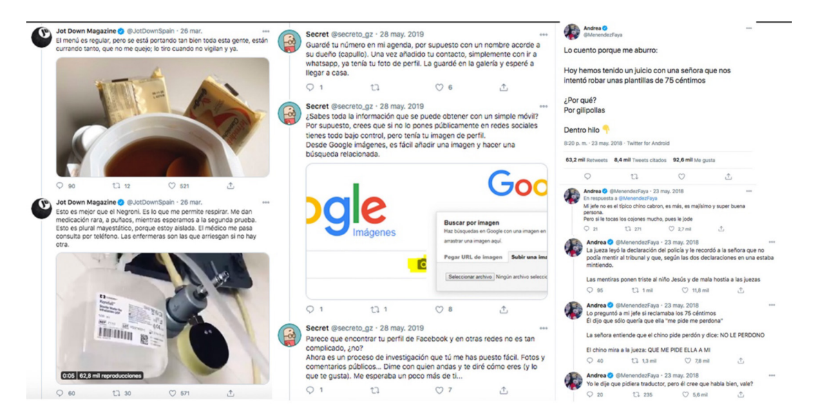
Image 4. Cultural references present in Twitter threads

conclusion. Others admit that, at some point in the fictional threads, they detect that it is a story created by the tweeter who is publishing the thread but that they are so attracted to the narrative rhythm that they continue reading it until the end. The interviewees point out that what is important for a thread to be successful is that the content is good and not so much the format it uses.