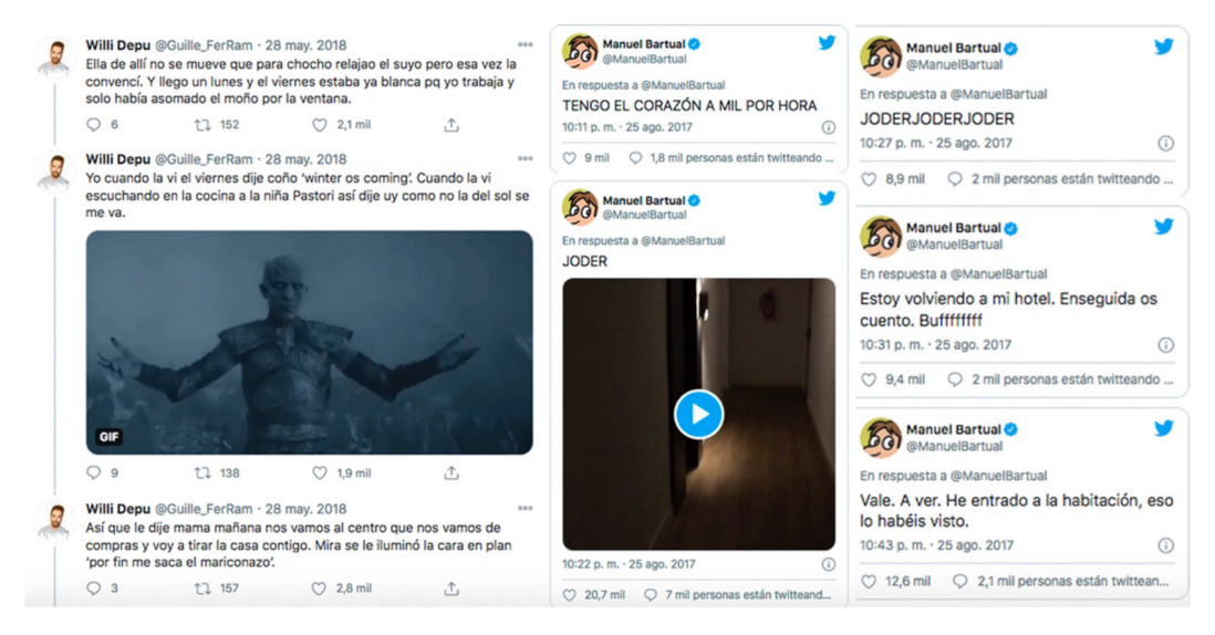
Image 2. Popular and rude expressions used in threads.

washings. I have a detergent at home that cost me 5 euros and it says it has enough for 30 washes. 40 euros would cost me to do 240 washes") and, by far, the so-called "vampirization" (references to popular culture), through allusions to current affairs, music, cinema, television series, etc. (appearing among others Game of Thrones or images of the Kardashian family). These resources are not always reflected in the text of the tweets but can also be presented through the use of gifs or emoticons, which are very frequent in some threads (image 3 and image 4).