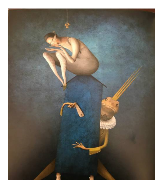
Figure 2. Illustration by Pacheco for "El niño mudo".

Pinar, 2007), and a musical note is placed next to it -a recurring element that already appeared in Caracola (figure 1).