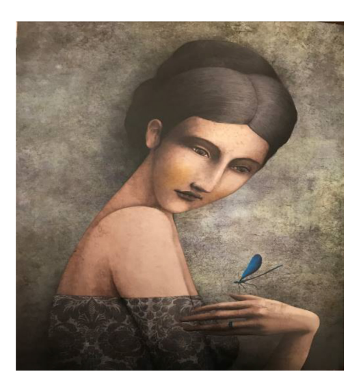
Figure 4. Illustration by Pacheco for "Escuela".

On the contrary, the maiden takes a central stage in Pacheco's illustrations. In contrast to the general level in which Calatayud integrates his two characters, with an almost symmetrical interaction between text and pictures (the word "school" can even be seen below), the portrait of a young girl who receives a dragonfly in her hands takes up the page in this interpretation. The relationship with the recipient is greater, in accordance with the sense of level use and the objectivity pointed out by Nodelman (1988). The mystery conveyed in the poem is enhanced; furthermore, introducing the dragonfly, which does not appear in the text, may be a visual metaphor