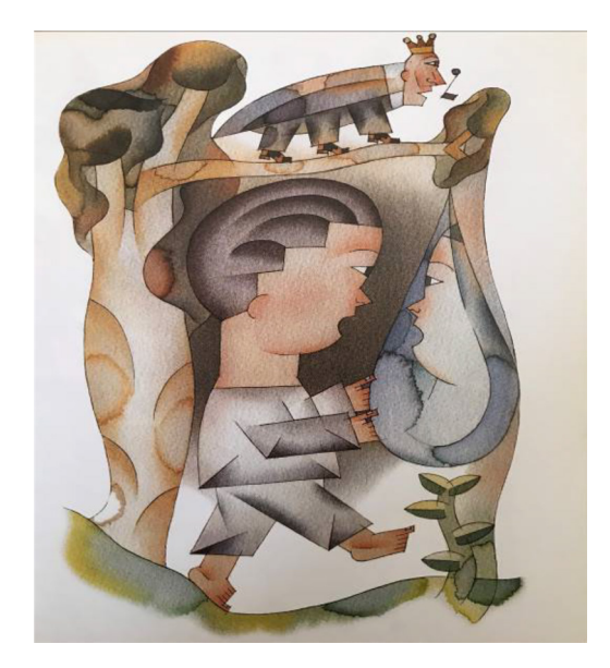
Figure 1. Illustration by Calatayud for "El niño mudo".

The central role played by a child continues to mark this poem. The first stanza presents the situation of a child looking for his lost voice, supposedly kept by the crickets. The idea of an insect characterised by a powerful sound that floods the fields in the night is opposed to the silence that shackles the child, so the appropriation of his voice is emphasised. The search focuses on the water, "In a drop of water/the child looks for his voice", a symbolic element as well that can represent death in Lorca's poetics, when water is retained in ditches, cisterns..., or can be a sign of