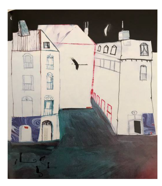
Figura 7. Illustración by Zabala for Santiago.

There are other motifs and shapes that are repeated: the elongated figures on the trees, for example, or the children. We should also add the cats' silhouettes, which usually appear in the works illustrated by Zabala (Martín-