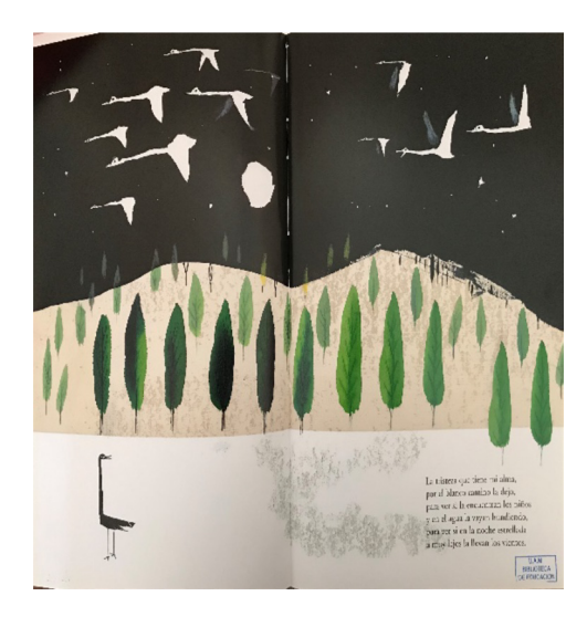
Figura 6. Illustration by Zabala for Santiago.

the characters, the woman, the children, or the cows in this case..., seem to float.